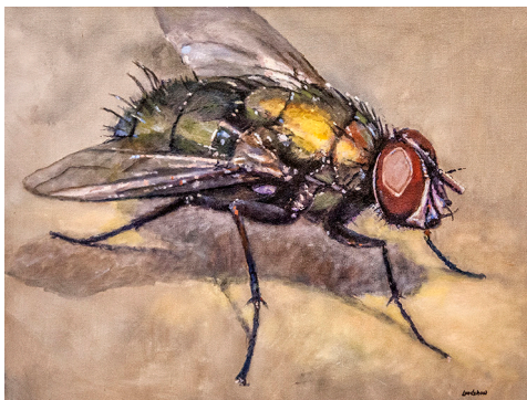
Honorable Mention Fly Rodger Lundskow