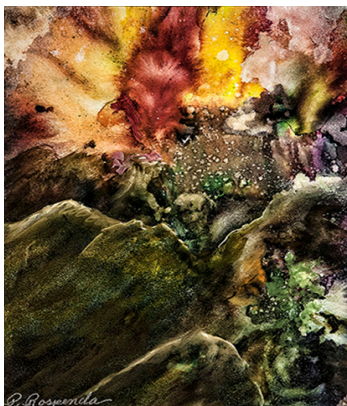
2nd Place Fury From Within Pat Rospenda