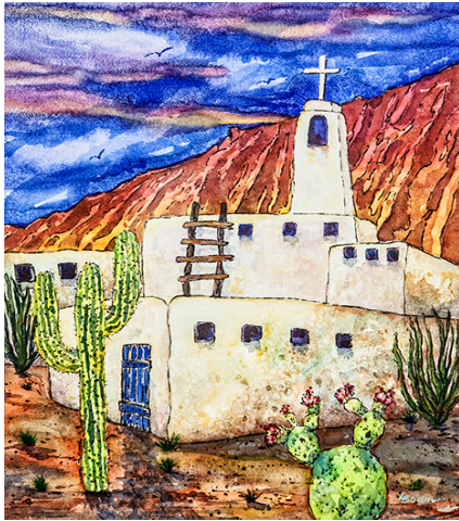
2nd Place Santa Fe Lynda Burruss