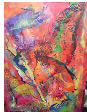
Connecting with Patterns