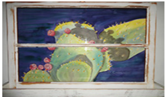
Gerry Carroll Prickly Pear