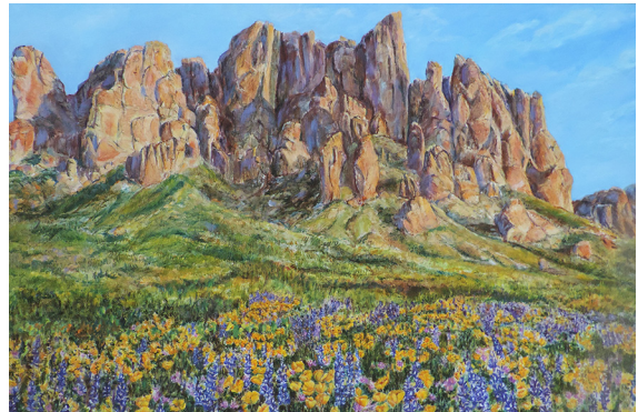
Lupe Cavanaugh Superstition Mountain in Bloom

Beatitudes – March 4, through June 3, 2015