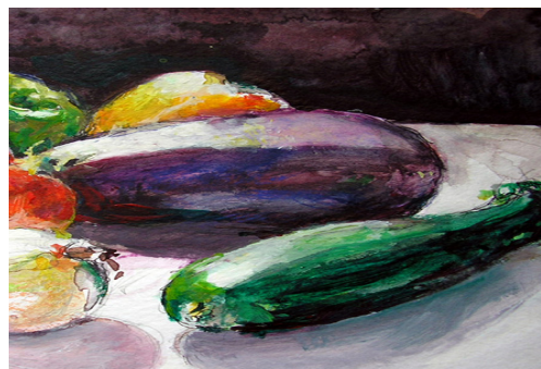
Vicki Lev - Ratatouille

Devonshire December 1, 2014 through January 31, 2015