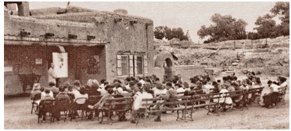
AAG meeting at Pueblo Grande Museum - 1930

During the hot summer of 1928, a group of artists met for an afternoon to sketch and discuss the future of art in Phoenix and the impact the artists should have on the future cultural development of the city.