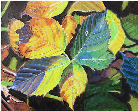
1st Place Autumn Leaves Velvet Tetrault