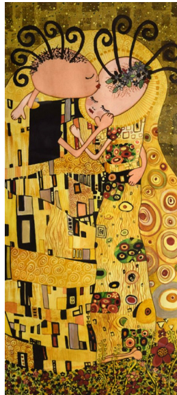
2nd Place Kokapelli Kiss Lynda Burruss