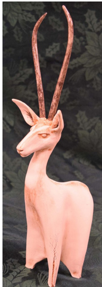
2nd Place Gazelle Melanie Mead