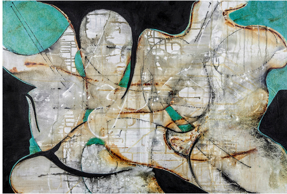
1st Place Transitioning Dyanne Fiorucci