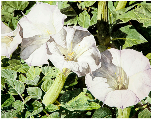
1st Place Sacred Datura Ralph Sellers