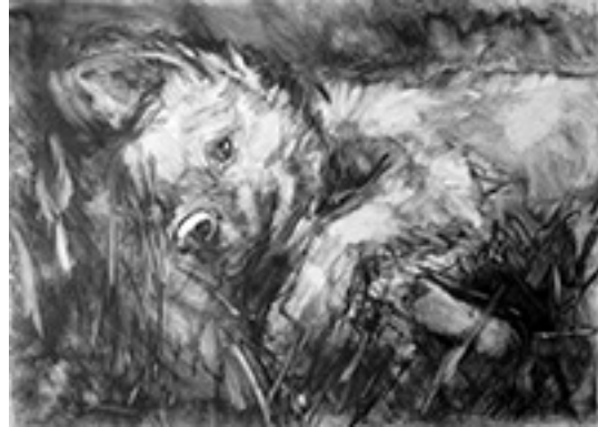
Ann Howey Falvey

Beatitudes: September 7 to December 6, 2017